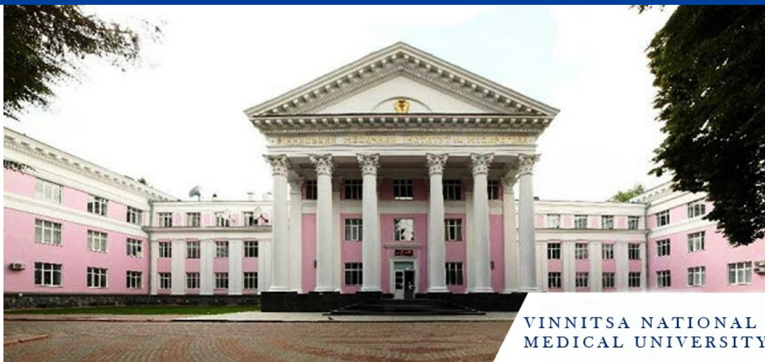
VINNITSA NATIONAL MEDICAL UNIVERSITY

6 Years MD Course (Equivalent to MBBS in India)